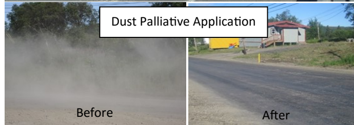
Dust Palliative Application